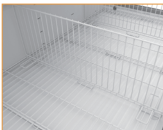
WIRE TRAY & PRODUCT DIVIDER