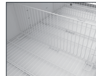
WIRE TRAY & PRODUCT DIVIDER